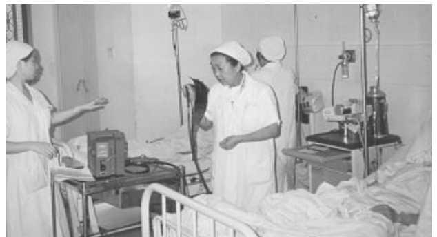
Clinic staff, Guangdong Provincial Hospital; 1995

out, the young Physician was delighted to have the opportunity to practice his English and enjoyed discussing the various patients he cared for on the wards. He looked for affirmation about therapeutics, keen