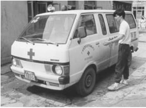
Nissan vanette ambulance, 6th Guangzhou People's Hospital

to know if treatments were similar and very interested to know of other medications not available in China. Most of their medications are manufactured in China. IVs (incidentally usually sited in the lower limbs) appeared to be mandatory.